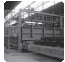
Bogie hearth furnace

At least once a year, at least twice a year in the case of biologically produced methane.