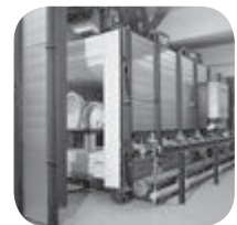
Bogie hearth furnace